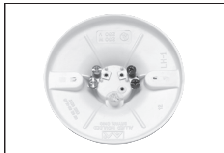
Double Screw Terminal